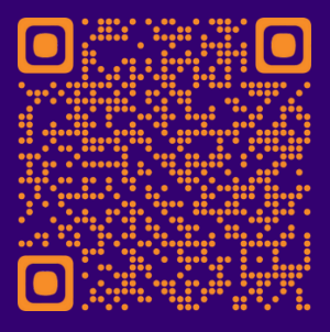
SCAN for more information